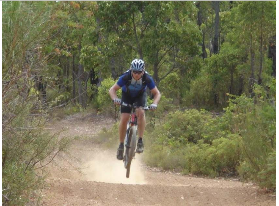
The Nimble on the Munda Biddi Track

The Gibb River Mountain Bike Challenge is now in its fifth year and is getting bigger and better every year. This year's event hit