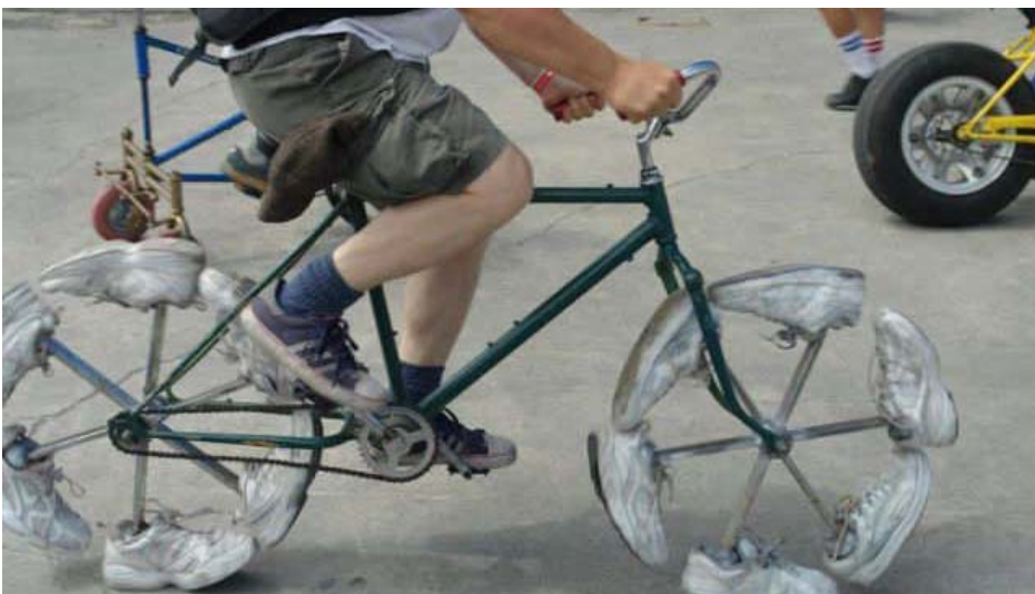
Not exactly rubber pedals; and not likely to catch on either .....