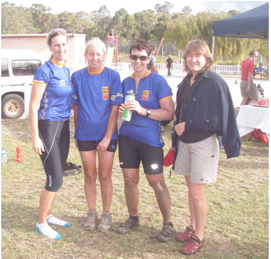
The Munda Bidli Maiden's strike out in the Karri Cup 2011

So, if you have any interest in mountain biking, Northcliffe is the place to be on Labour Weekend.