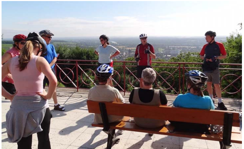
Talk about cycling with a view ....

Pouilly known for its wine, good food and local goat's cheese.