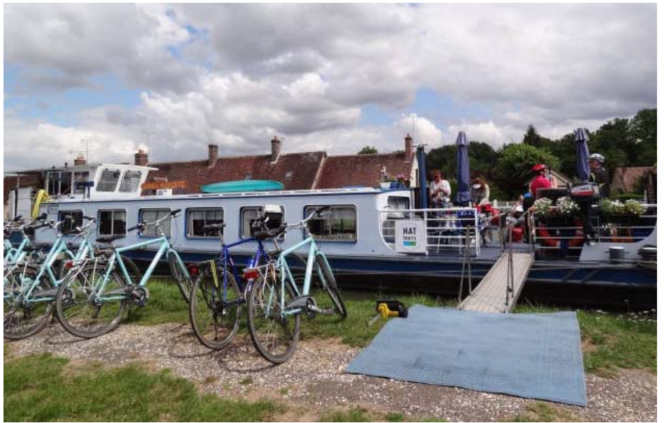
Our floating hotel which followed us along the river

Old town of Nevers with its church and battlement walls and towers.