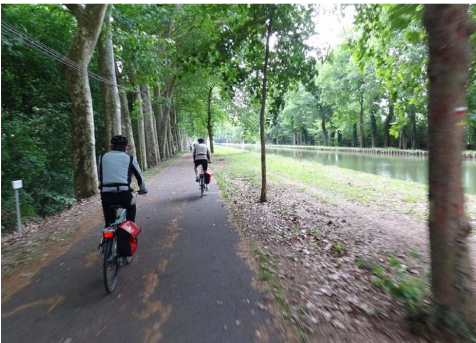
A typical part of the cycle track along the river

The bikes had 24 gears with twist grips and Dutch type handlebars. They had an on-board key locking system. From my point of view, not the most comfortable bike to ride, particularly for some of the hills around Sancerre. But this company caters for all types of cyclists so the bike is