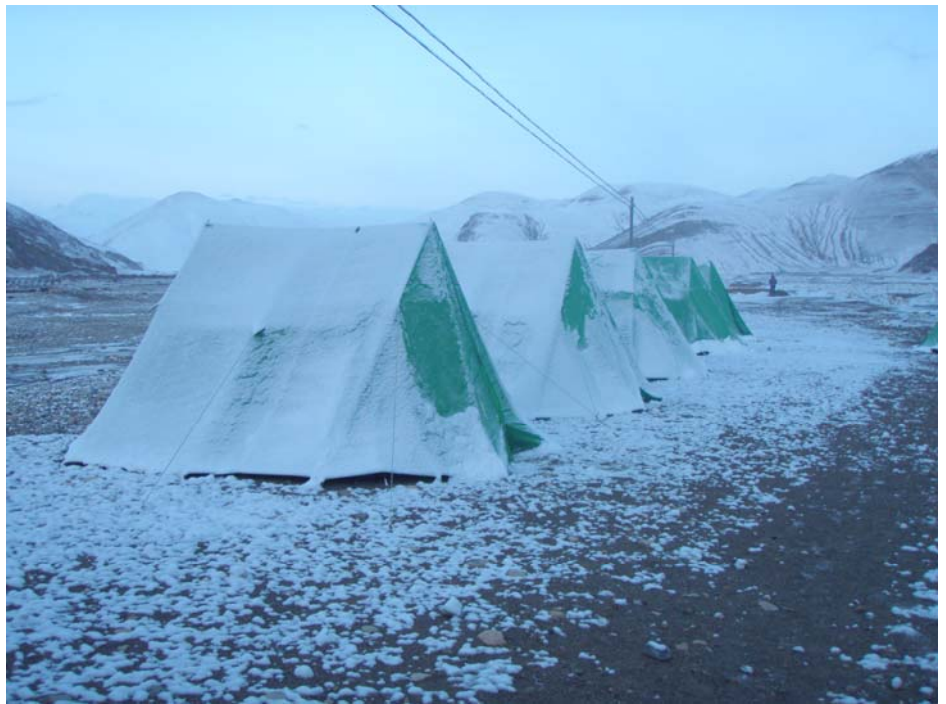
Tents in the Snow

Sadly, we only saw tantalising glimpses of Everest because of the snow. Our two har-