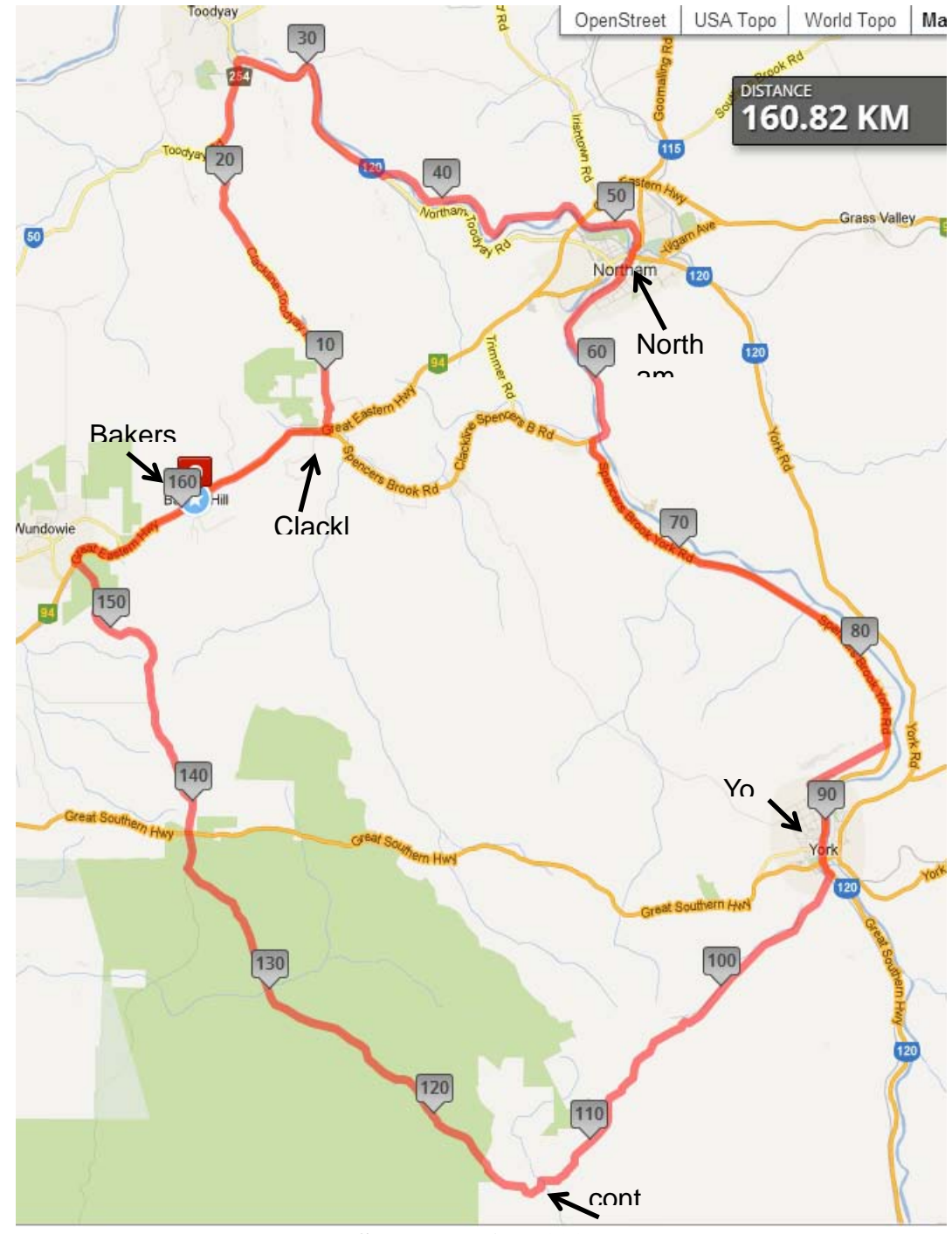
Start elevation 303m Maximum elevation 376 m Total gain 737m

The route map can be viewed and zoomed in for details etc at <a href="http://www.mapmyride.com/routes/fullscreen/205794608/">http://www.mapmyride.com/routes/fullscreen/205794608/</a>